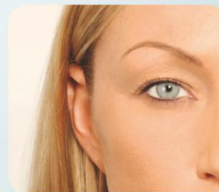
... and after