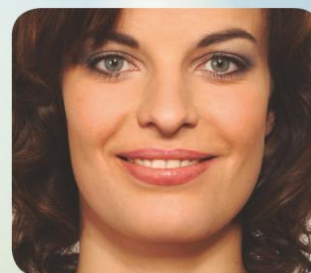
... and after