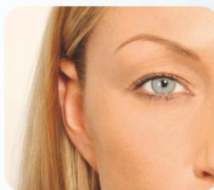
Eyeliner: before ...

The individual effect is a result of your choice of procedure and intensity, your color type, age, and skin structure. No matter which permanent makeup procedure you choose, the look should suit your type and enhance your features in a balanced, natural way. Here are a few examples: