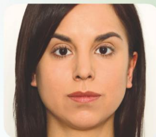
Eyeliner: before ...