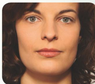
Lip enhancement: before ...